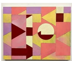
Dominic Beattie The Way , 2024 Ink, spray paint, varnish and card on birch ply panel 29.5 x 35 cm