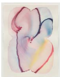
Barbara Nicholls Wait Four, 2013 Watercolour on Saunders Waterford 300 gsm HP 36 x 28 cm