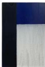
Tom Wilmott The Waltz 7a , 2017 Emulsion & tempera on hardwood ply panel 30 x 20 cm