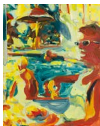
Eleanor May Watson The Day Waves Yellow , 2024 Oil and acrylic on board 25.4 x 20.3 cm