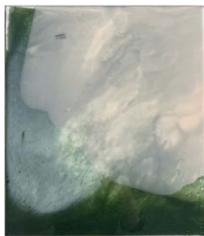
Fleur Simon Fold , 2024 Resin on plywood 41 x 35.5 cm