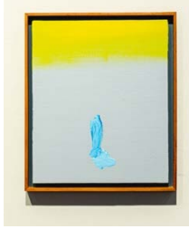
Christopher Brooks Small Grey Blue Blue 2022 Signed, titled and dated verso Oil on board 32 x 27 cm