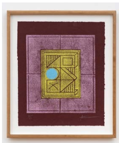
Anna Liber Lewis Sex (XO), 2022 Block print (oil on paper) 30 x 35 cm Edition of 10 (#2/10)