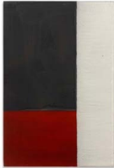
Tom Wilmott The Waltz 3c, 2017 Emulsion & tempera on hardwood ply panel 30 x 20 cm