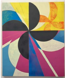
Dominic Beattie Two Thrones , 2024 Spray paint, ink and varnish on birch ply panel. 60 x 50cm