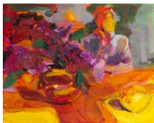
Eleanor May Watson Let The Day Drop Down 20.3 x 25.4 cm Oil on board