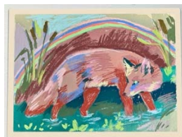
Rachel Dinwiddie Daytime Montage 1st , 2022 Gouache and soft pastel on paper 23 x 30.5cm