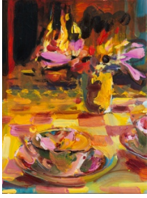
Eleanor May Watson The Petals Are Harlequins , 2024 Oil on board 30.5 x 23 cm