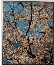
Alik Braine Turbulence, Cherry Blossom (No.2) 2020 Colour photograph from cut and repositioned negative framed