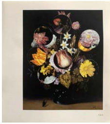
Alik Braine Turbulence, (Cat. 1 after Bosschaert) 2021 Cut and rearranged catalogue page 26 x 28 cm (Print size 21 x 23 cm)