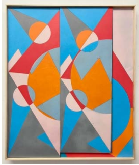
Dominic Beattie Heraldry , 2024 Ink, spray paint and hardboard on birch ply panel 60 x 50 cm