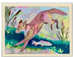
Rachel Dinwiddie Daytime Montage 2nd , 2022 Gouache and soft pastel on paper 23 x 30.5 cm