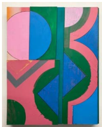
Dominic Beattie Garden Window, 2024 Spray paint, ink, wood and varnish on birch ply panel 35 x 28 cm