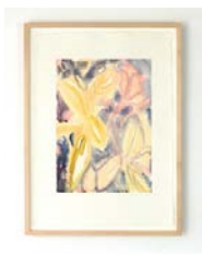
Tamsin Relly For The Bees 2021 38 x 28cm Water based monotype on handmade Indian paper 300gsm