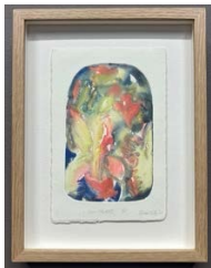
Tamsin Relly I Am Nature III 2021 Water based monotype on Somerset paper 300gsm. 15 x 10cm