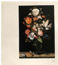
Alik Braine Turbulence (Cat.8 after van der Ast), 2021, Cut and rearranged catalogue page 26 x 28 cm (Print size 21 x 23 cm)