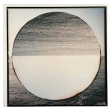
Alik Braine The Second Day , 2020 Colour photograph from cut and repositioned negative 20 x 20 cm framed