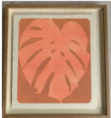
Tamsin Relly Monster Leaf 2023 29 x 26cm Monotype on Somerset Paper 300gsm